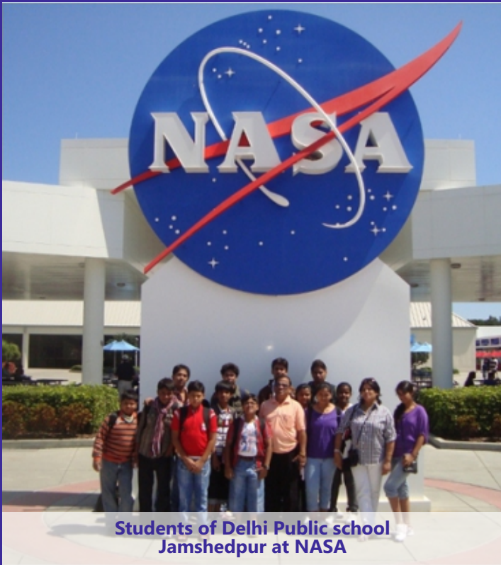
Students of Delhi Public school Jamshedpur at NASA

Transfer to Washington after breakfast. Reach Washington in 4 hours and Go for a Guided tour of the City with the help of a Guide. We will visit the Air and Space museums, The FBI building, The White house , The Capitol Hill, The Lincoln Memorial, The Washington Memorial, The Korean War Memorial, The Pentagon etc.